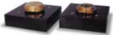
Antenna/Preamplifier without fairing