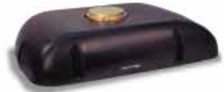
Antenna/Preamplifier with fairing