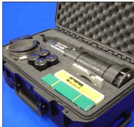
CP Gun is delivered in a protective case