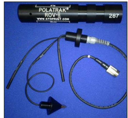
ROV II Probe has dual Ag/AgCl reference electrodes (shown)

Deepwater Corrosion Services Inc. 10851 Train Court, Houston, TX 77041 USA Telephone +1 (713) 983-7117 Email sales@stoprust.com www.stoprust.com