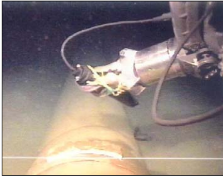
ROV II probe for a pipeline survey