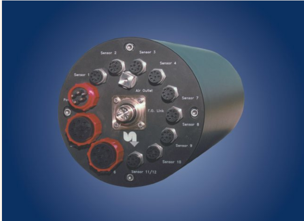
Subsea Electronics Bottle