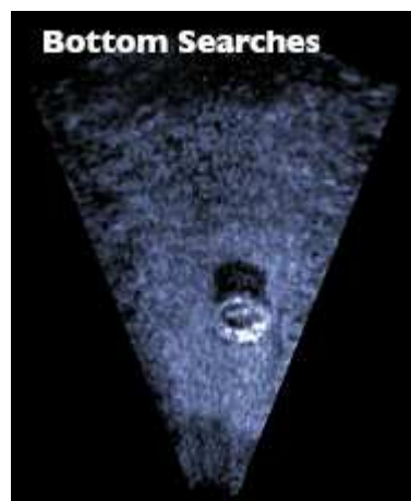
Quickly locate and navigate to objects, even in low visibility conditions. The above sonar image shows a tire located during an ROV-based search operation.